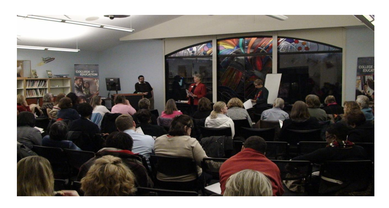
St. Louis Area Teachers attend Professional Development program in the MSEC auditorium

Since 2006, the TLC has hosted the Digital Media Festival to encourage the creative use of digital media within the primary and secondary classroom setting to meet learning objectives. The festival is designed to be an event that showcases and rewards strong DV or interactive media examples in education. It provides students and teachers in the St. Louis region with an authentic outlet for their work, transcending chalkboards, allowing for an opportunity to collaborate with others. Videos from this year's winners can be seen at <a href="http://coeexchange.com/?p=5644">http://coeexchange.com/?p=5644</a>.