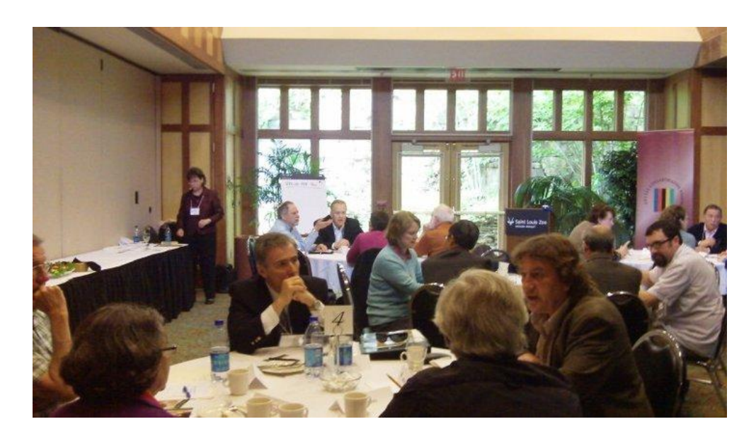
DLCV Professors, April 25, 2011 meeting at St. Louis Zoo

As a result of the meeting, several professors have begun new discussions about opportunities for working together and broadening their networks of resources. From here, we will consider ways to facilitate better communication, strengthen partnerships, and address issues of uncertainty.